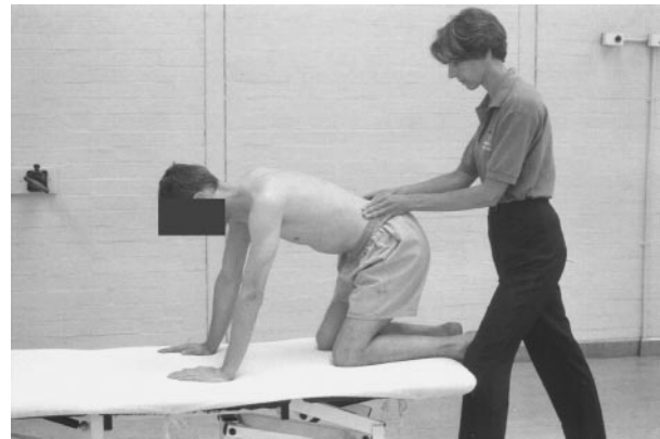
Fig. 1—A central SNAG applied to the L4 spinous process in 4-point kneeling with the model rocking back.

The patient was then returned to the prone position over the pillow. On re-assessment of the PAIVMs palpation findings, there was no resistance and only minor discomfort. With the patient in this prone lying position a cephalad glide on L5 was applied whilst active slow, small pelvic anterior tilt movements were performed (Fig. 2). Applying this glide to L5 resulted in a relative extension glide at the L4/5 facet joint. This was done to restore extension at the L4/5 joint. The glide applied by the physiotherapist must allow pain-free anterior tilt movement. The use of an anterior pelvic tilt instead of extension from the thoracic spine as proposed by McKenzie (1984) targets the lower lumbar spine extension more effectively. A strip of tape applied firmly across the erector spinae at the L4 level on the symptomatic side was added to reduce any residual spasm. Four-point