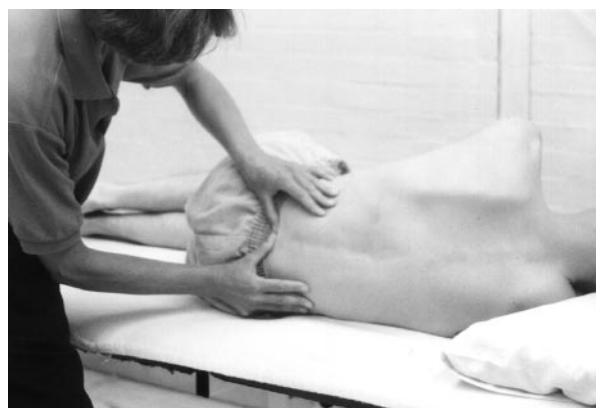
Fig. 4 —Side lying SNAG applied centrally to the L4 spinous process whilst patient performs a posterior pelvic tilt.

Abbreviations: R, resistance; P, pain, RSF, right side flexion; LSF, left side flexion; PA, postero-anterior; EOR, end of range; FROM, full range of movement.