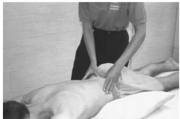
Fig. 2—Prone lying central SNAG applied to the L4 spinous process with anterior pelvic tilt and extension of the lower lumbar spine.

rocking and anterior tilting in prone were given as home exercises to maintain mobility.